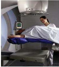
Elekta Synergy IGRT

The order for supply has been issued, the building is under construction and full commissioning is expected within December 2011.