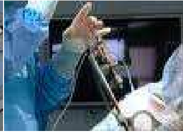
Elekta SRS system